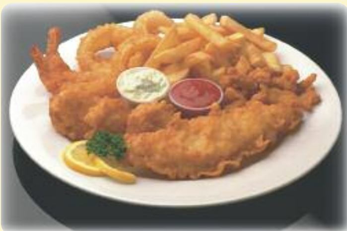
PLATE SHARING CHARGE $2.50

PHOTOS ARE FOR SUGGESTION ONLY • ACTUAL PLATTERS MAY APPEAR DIFFERENTLY.